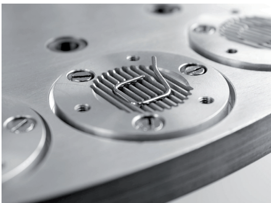
Mass measurement accuracy is periodically controlled using certified mass standard.