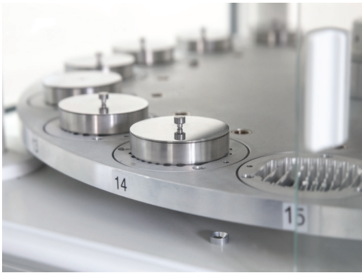
Each filter during conditioning is stored in a steel container