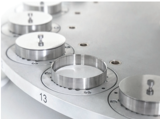
Filter identification is realised using a combination of a digital code of a measuring workstation, and the EAN code of a weighing container (option).