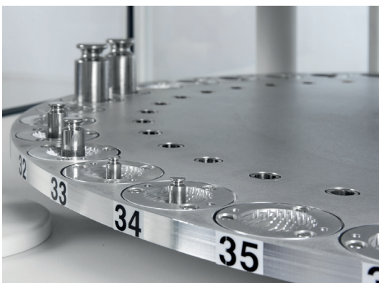
Possibility to load 36 objects onto the comparator's magazine. This allows to calibrate the whole set of weights during one course.