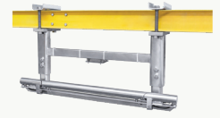
Overhead Track Scales