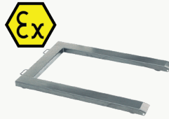
Pallet and Beam Scales

Pallet and beam platforms are proved constructions for pallet weighing. Equipped with casters and special holders they guarantee easy transport of the device onto the workstation. Livestock scales provide measurement accuracy and repeatability even in the case of weighing of an animal in motion. Track scales enable weighing of hanging load at the moment when a respective roll enters the measuring section.